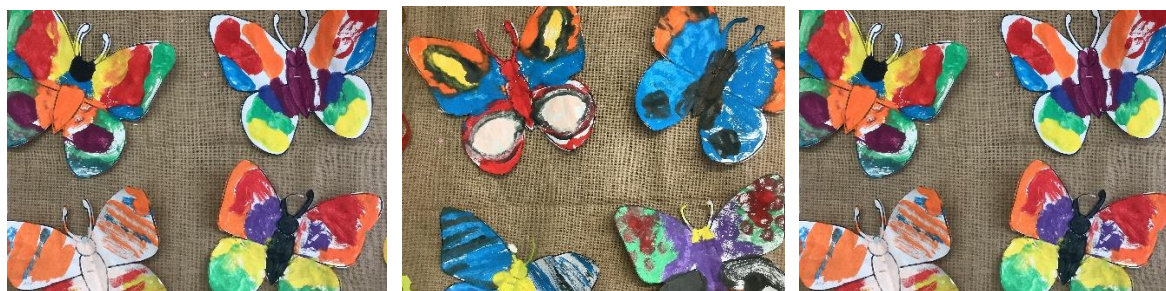
Paintings by pupils in Nursery