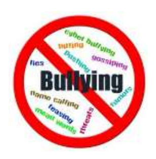
W/B 11<sup>th</sup> November

Positive behaviour and Anti-bullying week.