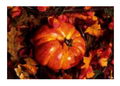
W/B 14th October

Harvest festival - Our whole school will collect food for the People's Kitchen & a local food bank and celebrate Harvest with parents/carers in a shared act of collective worship