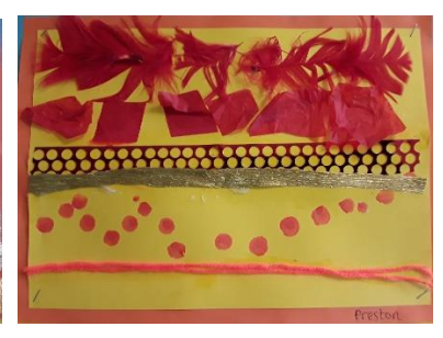
Summer Collages by Reception Pupils