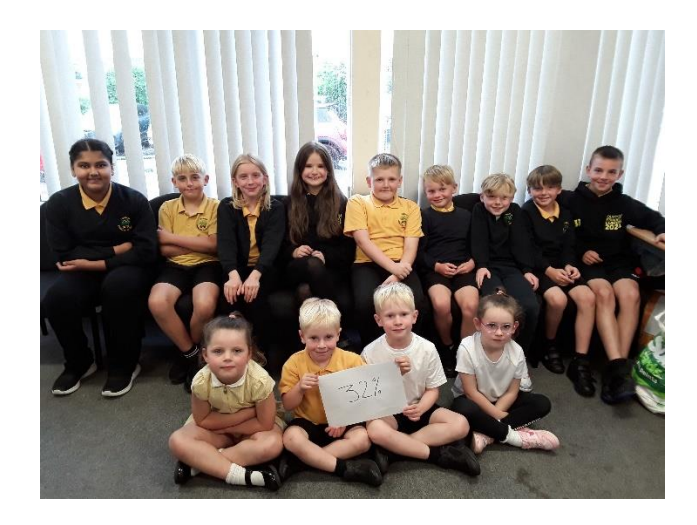
Our Waste Warriors!