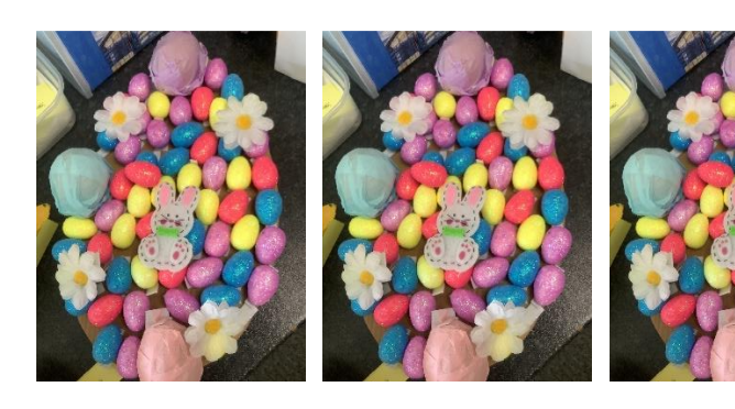
NEWSLETTER FOR PARENTS & CARERS: 28th MARCH 2024