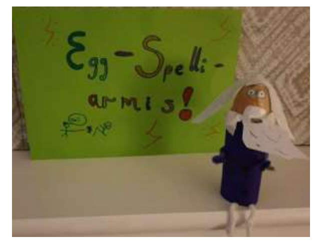
Leila - Year 6